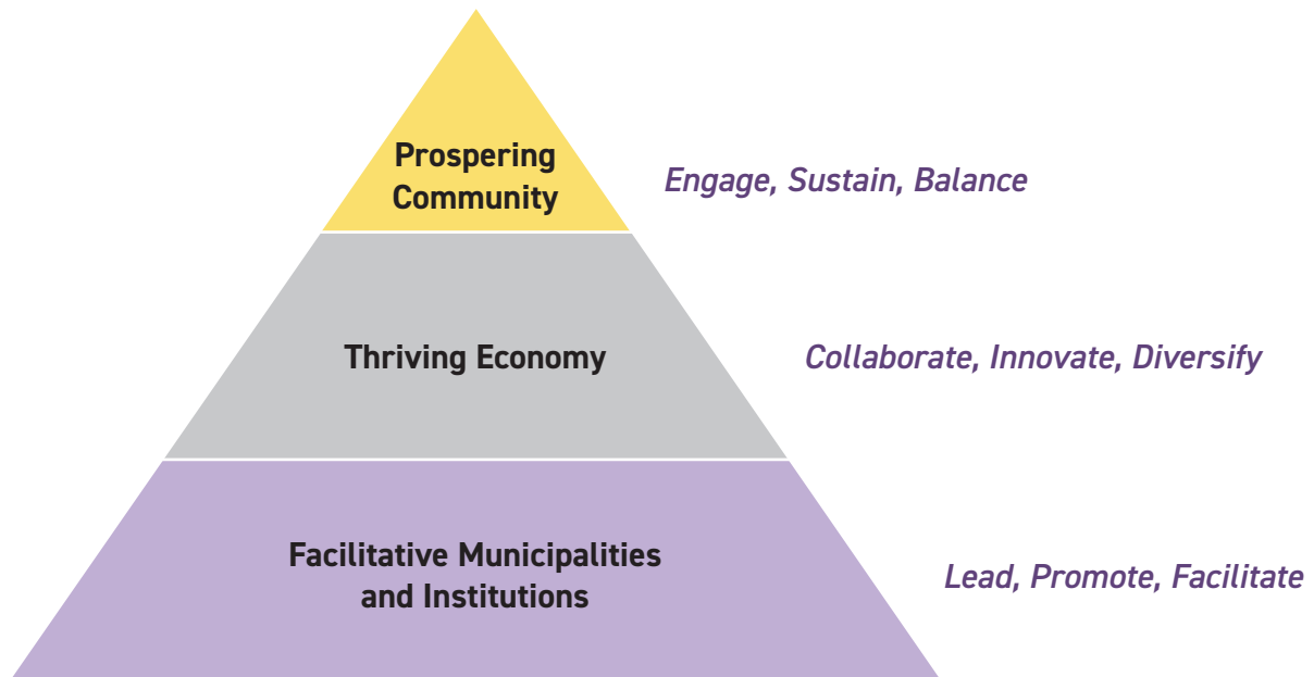
Exhibit 2 - Intelligent Sarnia-Lambton Community Focused Model

Facilitative municipalities and institutions are expected to lead the community towards prosperity, promote the region and facilitate the enhancements of the six pillars of an intelligent community. Industries and businesses collaborate and continuously innovate and diversify the economy. The prospering community at the top of the model actively engages in community affairs, leads sustainability initiatives and creates a work-life balanced community.