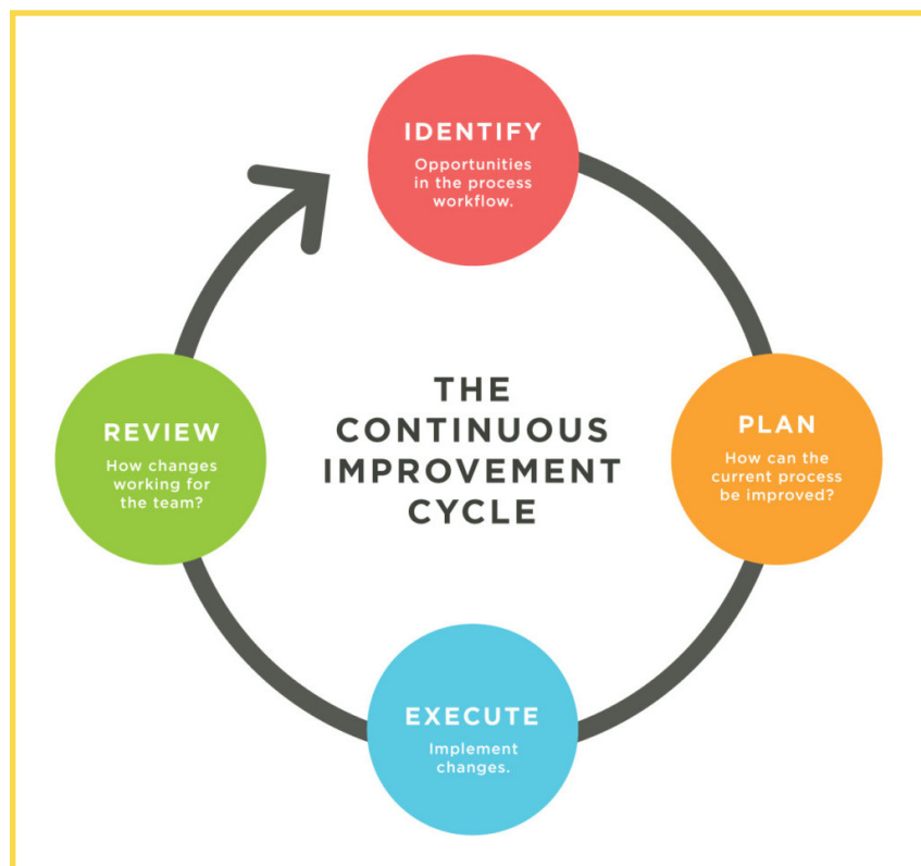
Exhibit 6 - Continuous Improvement Cycle

The Intelligent Sarnia-Lambton initiative has been led by the task force members from Bluewater Power and Bluewater Regional Networks, the County of Lambton, the City of Sarnia, Sarnia-Lambton Economic Partnership, Lambton College, Western Sarnia-Lambton Research Park and Brooke Telecom. This capacity could be significantly enhanced by creating an ICF institute in Sarnia-Lambton providing more resources for the continuous improvement of the strategic plan and its implementation. Sarnia-Lambton would, therefore, become an ICF node on the global network, strengthening its leading role, receiving well-informed guidance from the global think tank and learning and sharing information with other intelligent communities in Canada and around the world.